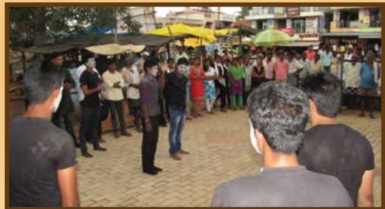
Street-play in progress in front of the Counselling Center at Hebbur