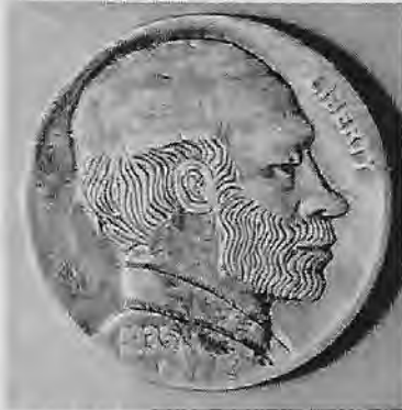
Self Portrait of an older "Bo"