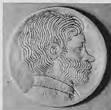
Self Portrait of "Bo"