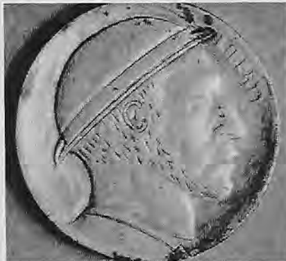
Domed hat hobo