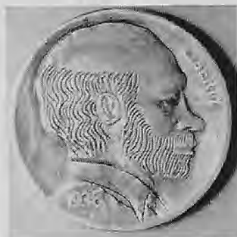
Self Portrait of an older "Bo"