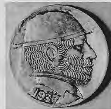
Bearded man with derby hat and carved date