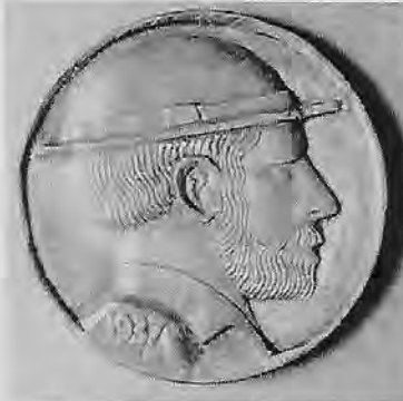
Bearded man with derby hat