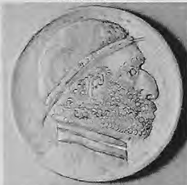
Bearded man with derby hat