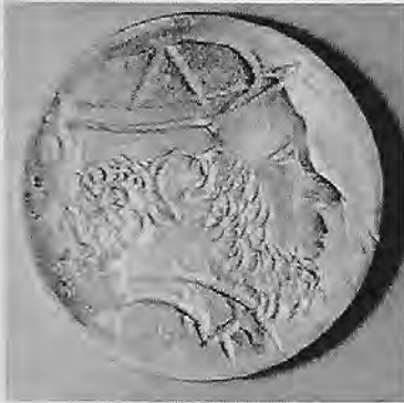
Man wearing cap