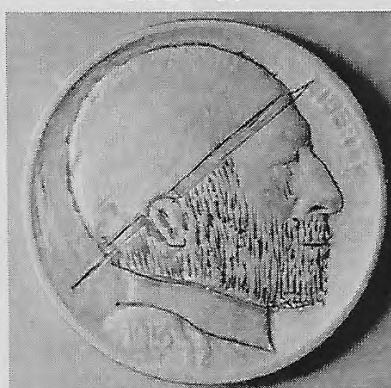
Bearded man wearing derby