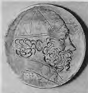
Man with curly beard and baseball cap