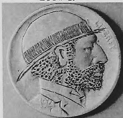
Bearded man wearing derby