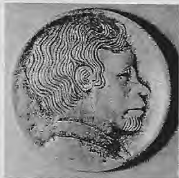
Self Portrait of "Bo"