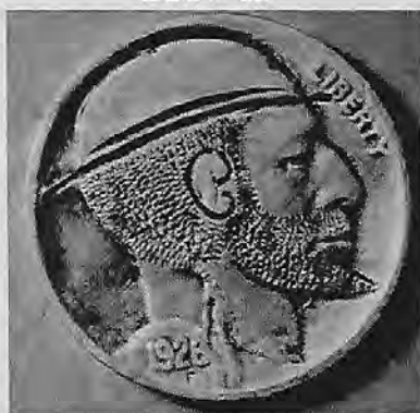
Bearded man with domed hat