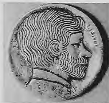
Self Portrait of "Bo"