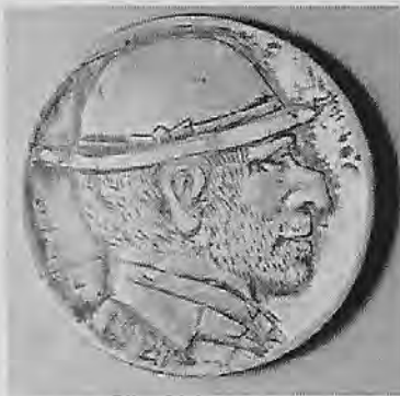
Man with derby hat