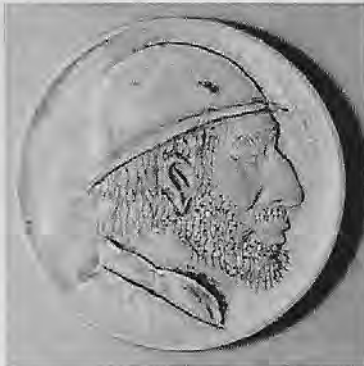
Man with beard and small hat