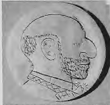
Bald headed & large nosed hobo.