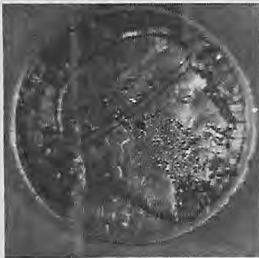
Domed hat hobo