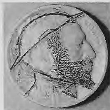
Bearded man wearing derby