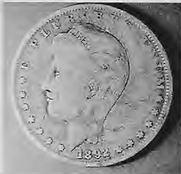
Altered Liberty Head