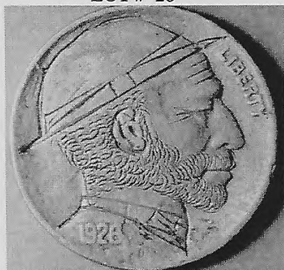
Bearded man wearing derby