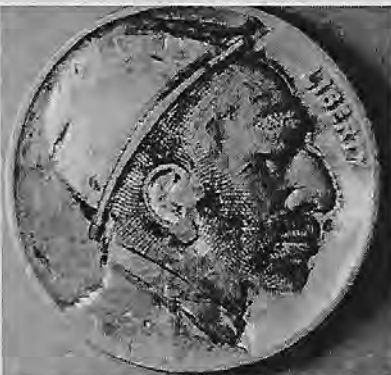
Bearded man wearing derby