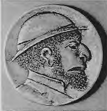
Ethnic man with beard and derby hat