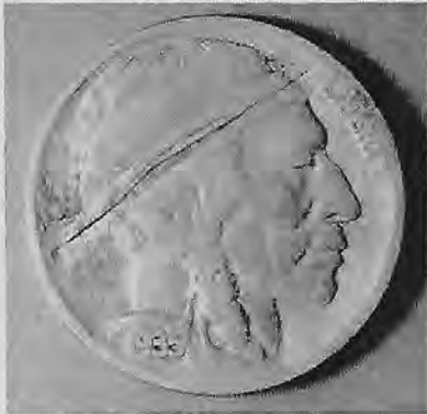
Indian wearing hat