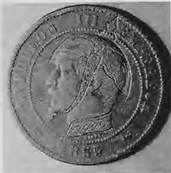
Helmeted Napoleon III