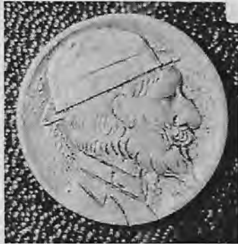
Domed hat hobo