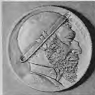
Bearded man with derby hat