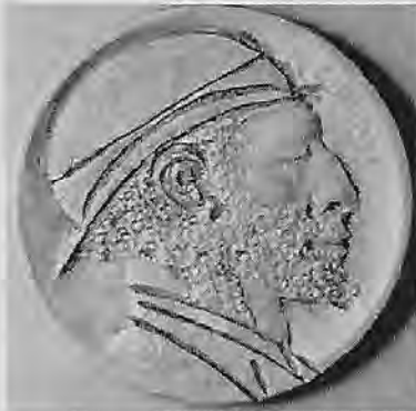
Bearded man wearing derby