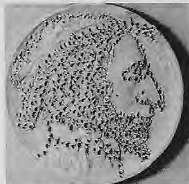
Bearded man wearing hat