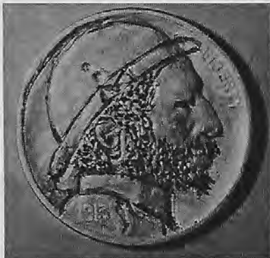
Domed hat hobo