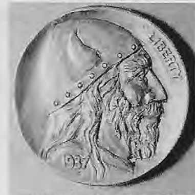
Viking Warrior with horned helmet