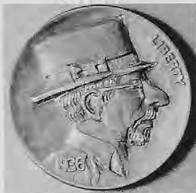
Long nosed man wearing top hat