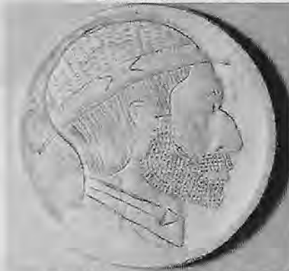
Bearded man wearing derby