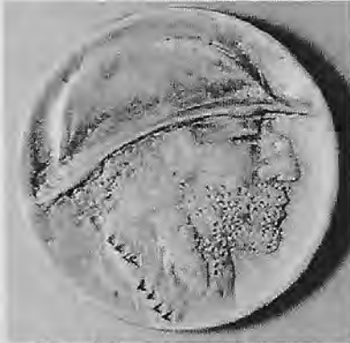
Bearded man wearing derby