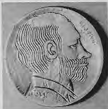
Self Portrait of "Bo"