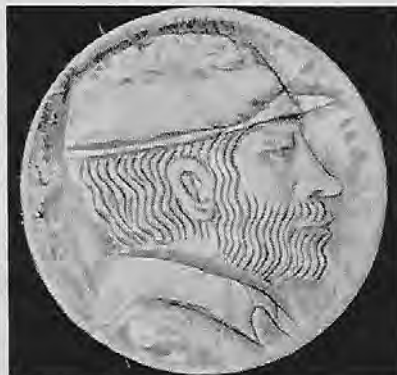
Bearded man with cap