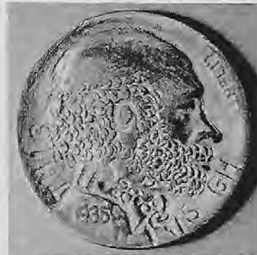
Self Portrait of "Bo"