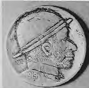
Man with whiskers and derby hat