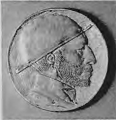
Bearded man with derby hat