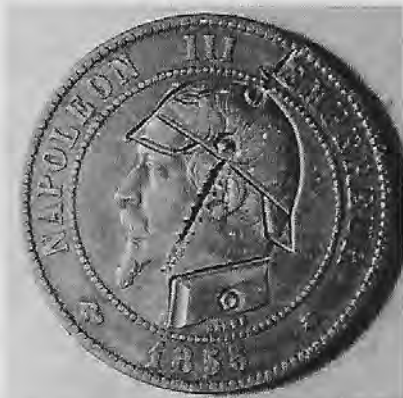
Helmeted Napoleon III