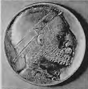
Bearded man wearing derby