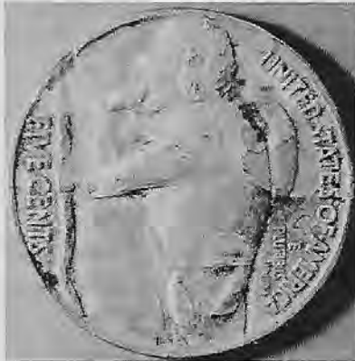
Hobo with back pack