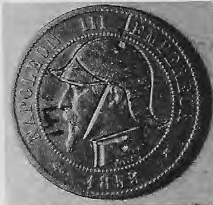
Helmeted Napoleon III