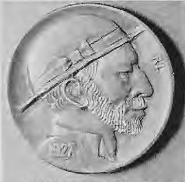
Bearded man wearing derby hat